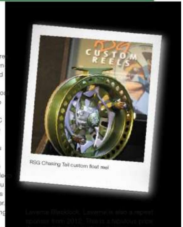
RSG Chasing Tail custom float reel